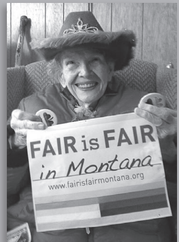
Fair is Fair supporters sported both green and rainbow hues at the Butte, America, St. Patrick's Day parade.

ONLINE: The new Fair is Fair website means individuals, organizations and businesses can show their support for fairness more easily than ever – just go to www.fairisfairmontana.org and click "Community." And don't forget to like us on Facebook and follow us on Twitter at @FairIsFairMT.